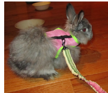
Beezie modeling her pretty harness and leash.

this and I always got lots of funny looks when I would walk her down our street. I figure she'll be happy to graze on some fresh grass though, so it might be worth it to her.