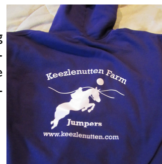
The back design on a hoodie

not be leaving for my parents' house until Christmas Eve.