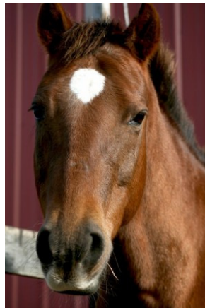
Copper is looking forward to some relaxation!